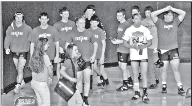
Towns County grapplers made it to the consolation finals in Area 3-A Duals at Holy Innocents.

"I couldn't have been more proud of the kids," he said.