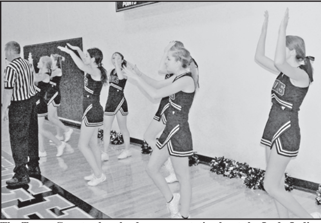
The Towns County cheerleaders are ecstatic about the Lady Indians 32-5 lead over Commerce

at the start of the third quarter, opening with a 16-2 run for a 47-20 lead which became 57-27 entering the mercy rule shortened fourth quarter. The Lady Indians outscored the Lady Lions 9-5 in that stanza which ended with the Lady Indians taking a 66-32 victory. Gabby Arencibia included two treys in an eight point first quarter and two more