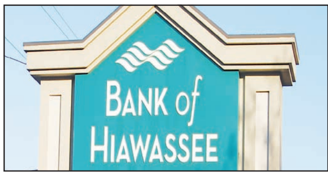
The Towns County main offices in the city of Hiwassee and the city of Young Harris will remain open, according to a legal notice in this week's edition of the Towns County Herald.

That location is the main office of the Bank of Hiwassee at 20 South Main Street, which will be the only branch in the city of Hiwassee. The branch