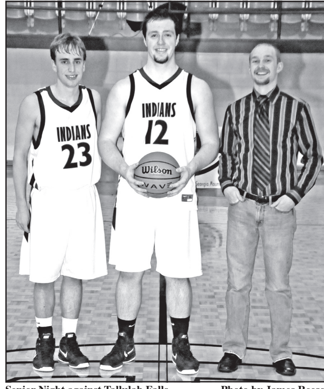
Senior Night against Tallulah Falls.