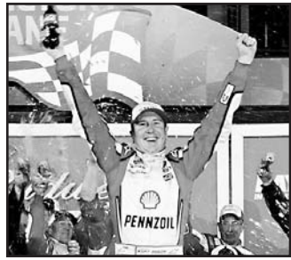
Kurt Busch celebrates his Bud Shootout victory longer enjoy the party. DALE JR ON POLE FOR DAYTONA 500 Dale Earnhardt Jr. will start on the pole in Sunday's Daytona 500. Jeff Gordon earned the outside pole position, during this past Sunday's qualifying trials. The remainder of the 43-car starting field will be determined by two Gatorade Duel races on Thursday. NASCAR plans to switch from old style carburetors fuel injection in 2012. They announced a partnership last week with two companies to develop and integrate fuel injection systems into the Sprint Cup Series, beginning with the 2012 season. Freescale Semiconductor will provide the processors for McLaren Engine System control units that will be used to manage the fuel and ignition systems in the engines for all Cup Series cars, replacing carburetors which have been used in the series since its inception in 1949. NASCAR and its top series teams will test the technology during the 2011 season with the anticipation of the systems being rolled out for the 2012 season. Weekend Racing: Everyone is focused on the Daytona International Speedway this week for NASCAR's first and biggest race of the season on Sunday. But there is plenty of other racing during the traditional period known as Speedweek. Thurs., Feb. 17: Gatorade Duels at Daytona. These are two 125-lap qualifying races. The first begins at 2 pm, and the second starts at approximately 4 pm. Both will be televised on Speed Channel. Fri. Feb. 18, Camping World Truck race, 1 of 25. Starting time: 7:30 pm; TV: Speed. Sat., Feb. 19, Nationwide series race, 1 of 34, Starting time: 1:15 pm; TV: ESPN2. Sun., Feb. 20, Sprint Cup Daytona 500, race 1 of 36, Starting time: 2 pm. TV: Fox. All times are Eastern. Racing Trivia Question: Lee Petty won the first Daytona 500. How many times did he win the series driving championship? Last Week's Question: Who was the oldest driver to win the Daytona 500? Answer: Bobby Allison in 1988. He was 50 years, 2 months, 11 days. The youngest was Jeff Gordon in 1995. He was 23 years, 10 months, 27 days. You may contact the Racing Reporter at: hodges@race500.com. NT(Feb16.C1)bc