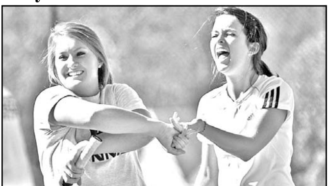
YHC Lady Mountain Lions showed moment of joy but fell 9-0 to the 18th ranked Shorter Lady Hawks.

Shorter College's nationally-ranked women's tennis program defeated Young Harris College 9-0 in a women's tennis match held at Brasstown Valley Resort in Young Harris Thursday. The Lady Hawks, ranked