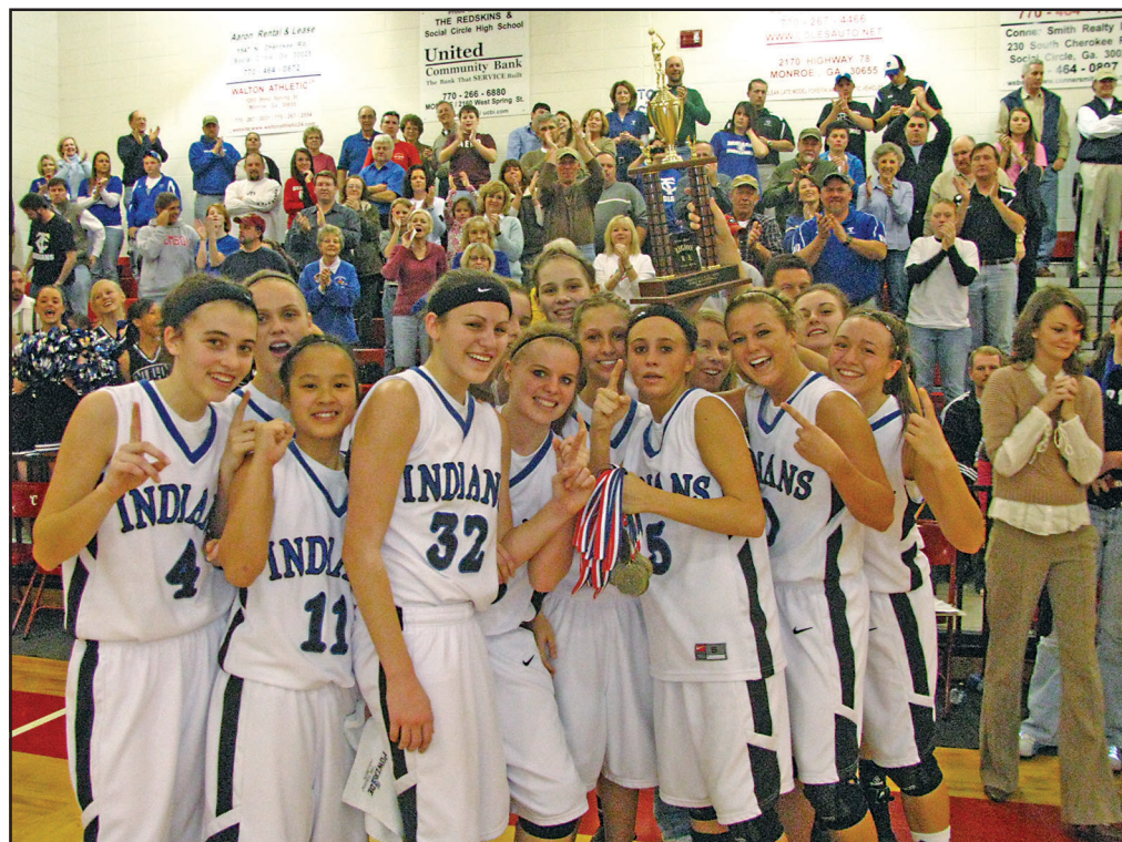
The Lady Indians won both games in last weekend's Region 8A Tournament.