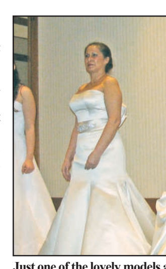
Just one of the lovely models at Sunday's Bridal Show at Brasstown Valley Resort. The event showcased products essential to pulling off the perfect wedding.

A fashion show brought the evening to a See Bridal Show, page 5A