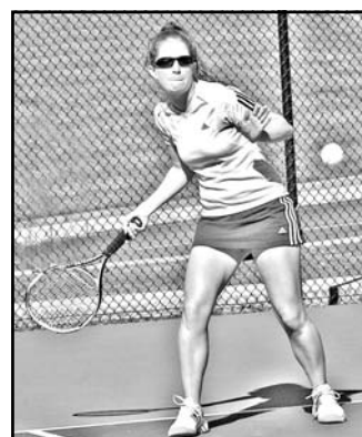
Playing on the TCHS courts, the YHC purple Cats fell to Lander University 8-1.