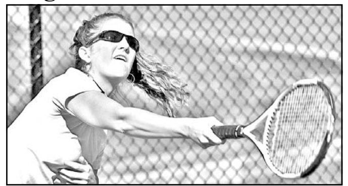
Despite a good effort, the Lady Cats were out-manned 9-0 by Berry College

The Mountain Lions are scheduled to return to action Saturday at 1 p.m., when they