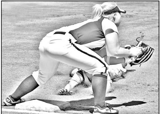
Young Harris College Tuesday, defeating the Mountain Lions 4-1 in the first game and 3-2 in the nightcap, which went eight

innings. The losses drop Young Harris' record to 6-6 overall.