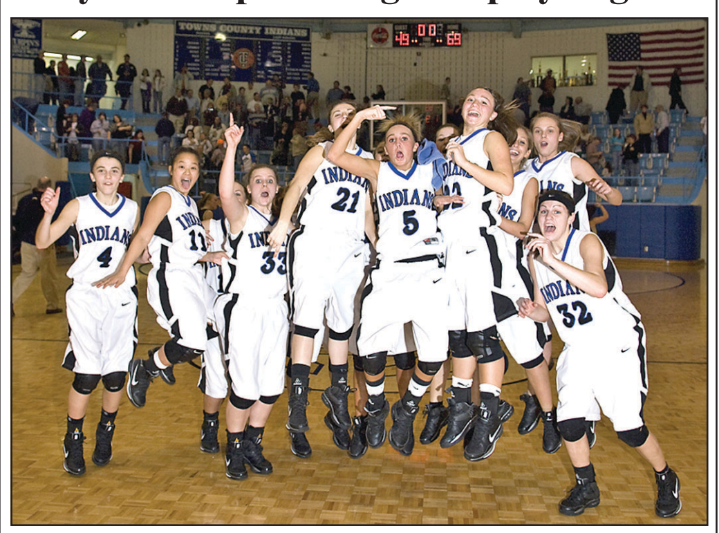
The Lady Indians defeat Eagles Landing Christian Academy 69-49 in the first round of the State Class A Basketball playoffs.