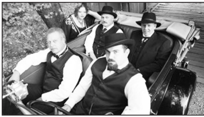
Barefoot Nellie & Co.

their award-winning performance to the Peacock Playhouse Saturday, March 24th at 7 p.m.