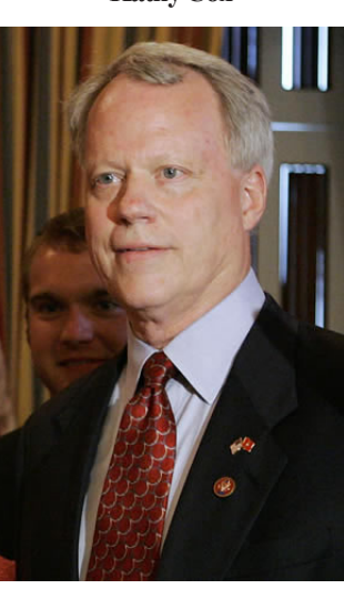
U.S. Rep. Paul Broun