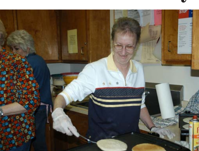
Flipping pancakes is an art and members of Unicoy Masonic Lodge's chased their meals with or- Eastern Star have it down to a science. The annual Pancake Breakfast served more than 400 hungry folks.

Center on Saturday. Lodge members helped serve up eggs, sausage and pancakes. Patrons ange juice or coffee. They made a difference in their community by purchasing a with the lodge members and cal high school students that breakfast plate.