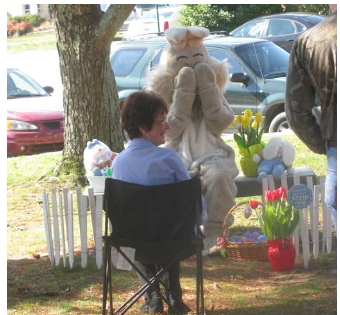
It was a day of fun, recreation and relaxation on Saturday on the Downtown Courthouse Square as the Egg-stra Relay for Life event was loads of fun for children of all ages.