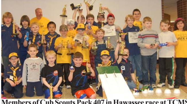
Members of Cub Scouts Pack 407 in Hawassee race at TCMS

race, each car had to be regis-siblings to bond with friends tered, weighed, and identified and family with the help of peted. It was an event to