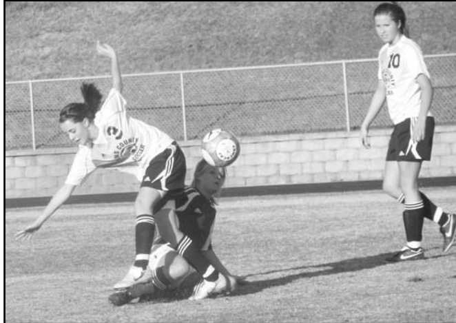
The Towns County Lady Indians and Union County Lady Panthers battled for 90 minutes plus two overtime periods before the Lady Panthers notched the Area 15 AA/A victory 5-2.

With their Union experience past them, there is nowhere to go but up for Towns County's soccer teams. With glimmers of hope in their eyes for the rest of the season, the Ladies and Gents will be ready for their next Area 15 AA/A battle of the cleats in Dawson-