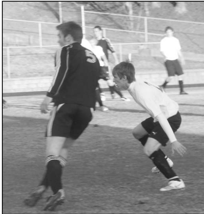
The Towns County Indians fought an uphill battle at Indian Field on Friday against the Union County Panthers. The Panthers scored the shutout with a 10-0 defeat of the Indians.

The Lady Indians square off against the Lady Tigers of Dawson County on Tuesday at 5 p.m., followed by the Indians match up against the Tigers at 7 p.m. at Tiger Stadium in Dawsonville.