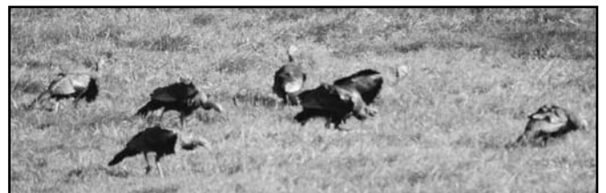
Towns County is prime hunting grounds for wild turkeys in Georgia. Turkey season is now underway and the state bag limit is three turkeys per hunter.

Both a valid hunting license and a big game license are required to legally hunt wild turkey. Wild turkey can legally be hunted with shotguns, loaded with No. 2 or smaller shot, any muzzle loading firearm, longbow, crossbow or compound bow.