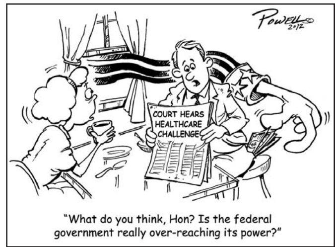
"What do you think, Hon? Is the federal government really over-reaching its power?"