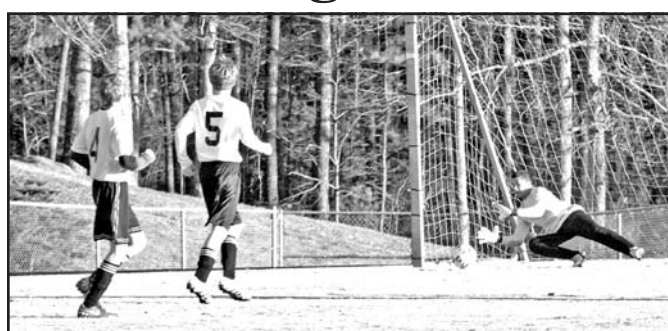
The Indians Goalkeeper has been busy making saves of late.

Come out and support the Indians as they battle their conference opponents on the soccer field.