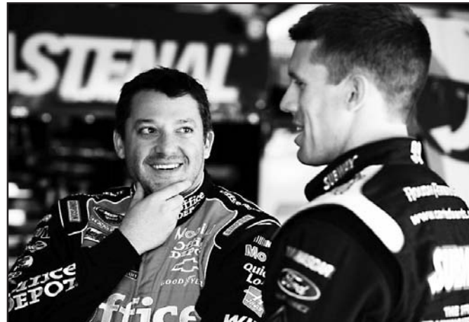
Tony Stewart talks with Carl Edwards after his California Cup win

The victory was Logano's first of the season, second at Fontana and the 10th of his career. Logano is the first Sprint Cup Series regular to win a Nationwide race