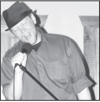
Compete for a recording contract!

Contestants are encouraged to invite their family and friends to support them during the competition for North Georgia Idol. The public is welcomed