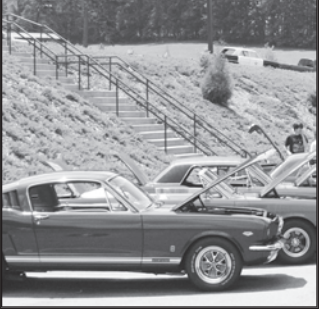
Enjoy the 2nd Annual Car & Bike Show

The Lodge at Copperhead is North Georgia's premier vacation destination and special events venue. A rustic mountain lodge surrounded by cabins nestled in a resort community offering Lodging, Casual Fine Dining,