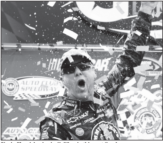
Kevin Harvick wins in California this past Sunday

Trevor Bayne, Joey Logano, Mark Martin, Aric Almirola, and Brad Keselowski rounded out the top-10