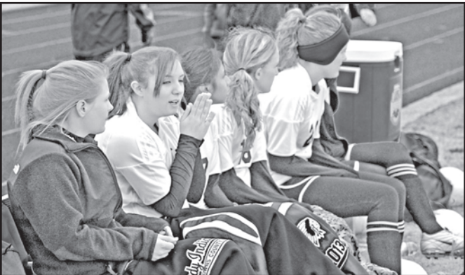
The Lady Indians braved the chilly conditions on Friday in their region match up with Athens Academy