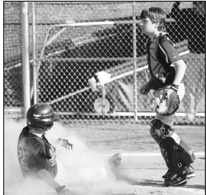
Run No. 12 crosses the plate for the Towns County Middle School Indians' baseball team last week in a 13-5 win over Lakeview Academy.

It was the perfect way to head into the school system's Spring Break for the young Indians baseball team.