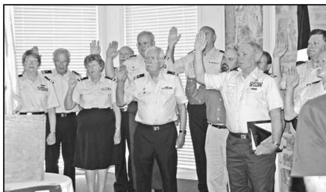
U.S. Coast Guard Auxiliary Flotilla 23 is now in service. The group was sworn in Saturday at The Ridges Resort.

The Auxiliary operates safety and regatta patrols and is an integral part of the Coast Guard Search and Rescue team. Auxiliary members also stand communication watches,