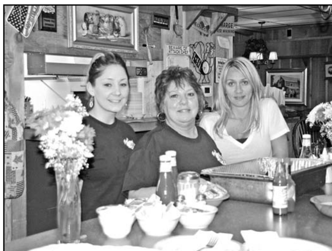
The lovely ladies at Mary Ann's Southern Grill located in Towns Place Shopping Plaza were just one of the hosts for Business After Hours.

Grill also was a hot spot among chamber members, who feasted on samples of chicken wings, chicken salad and tuna salad as well as the drink of their choice.