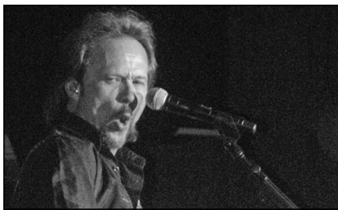
Travis Tritt put on a spectacular show Friday night at Anderson Music Hall. The Georgia natives sent folks home smiling.

After the raffles were complete, Travis took the stage. With an introduction by none other than Larry the Cable Guy, whose voice came over the speaker system pleading