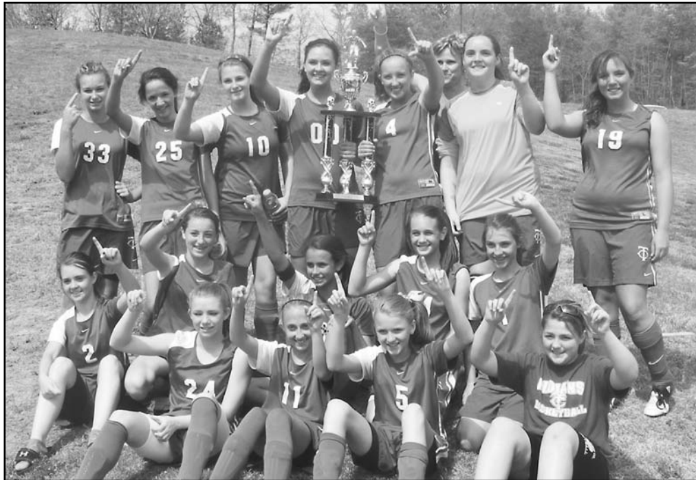
The Towns County Lady Indians Middle School Soccer team was crowned champions on Saturday at White County Soccer Complex in Cleveland. The Lady Indians completed a perfect 12-0 season with a 4-0 championship win over the Lakeview Academy Lady Lions.