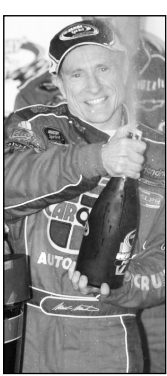
teams will be at the 2.66-mile Mark Martin wins at Phoenix

You may contact the Racing Reporter at: hodgesnews@earthlink.net.