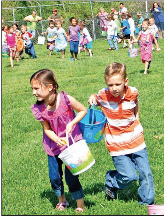
It was a mad dash to find valuable Easter eggs on Saturday at the Towns County Recreation Ball Fields.

The egg-hunters, children up to 9 years old, split into different groups – children ages 3 years and under and children ages 7 to 9 years old took to the ball fields in search of the more than 2,000 eggs hidden in the