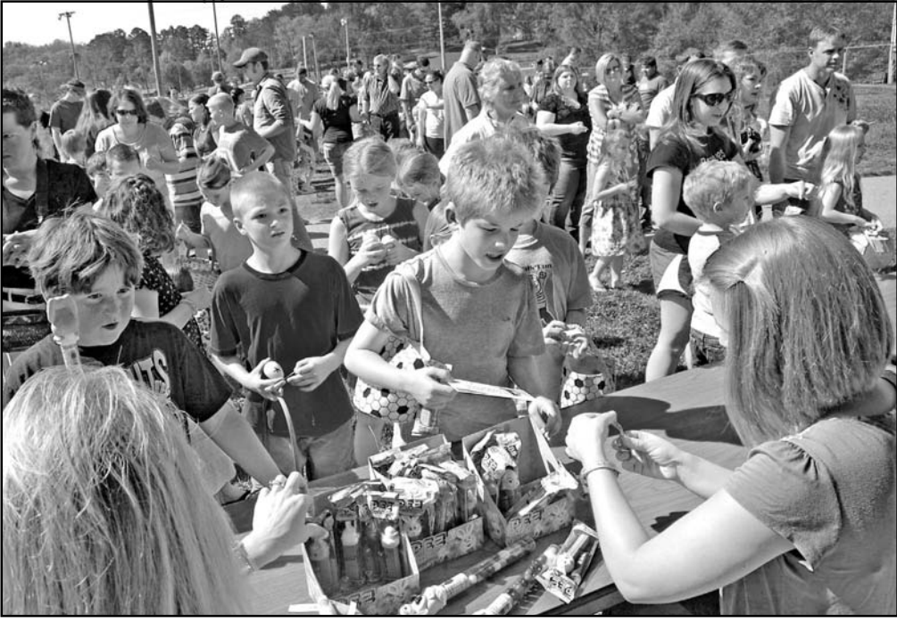
Towns County youngsters were out in full force on Saturday in search of fun and prizes during the 18th Annual Community-Wide Easter Egg Hunt.

"On Memorial Day weekend we'll have our fireworks show and we're really looking forward to that."