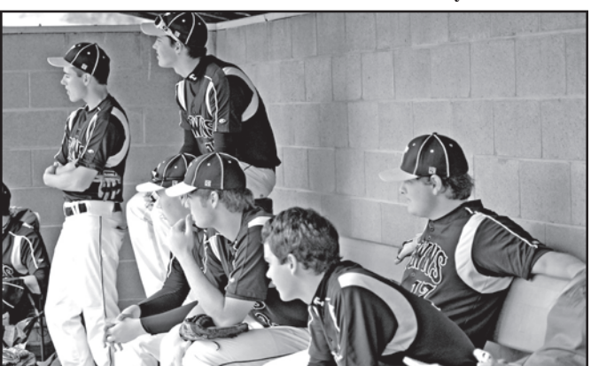
The Towns County Indians have begun to jell as a team scoring 49 runs in their last three games.