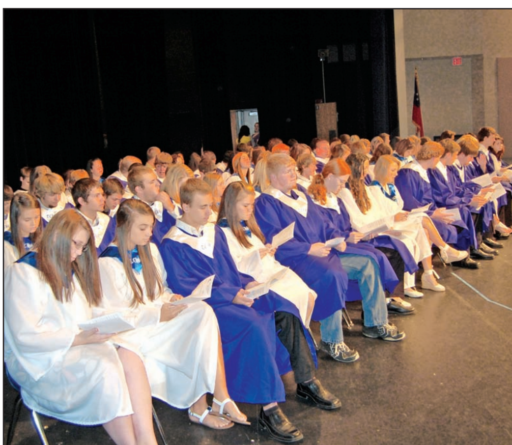
Towns County High School's Class of 2011 anxiously awaits Commencement Exercises on Friday in the Bill P. Kendall Gymnasium on the school's campus.