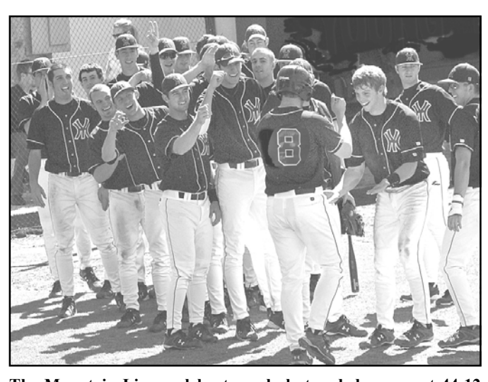
The Mountain Lions celebrate early but ended season at 44-12 and conference 22-7.