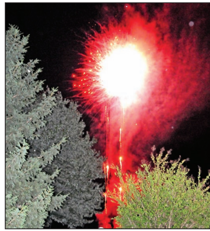
Event goers stared in awe as The Ridges Resort & Marina paid tribute to veterans on Memorial Day Weekend.