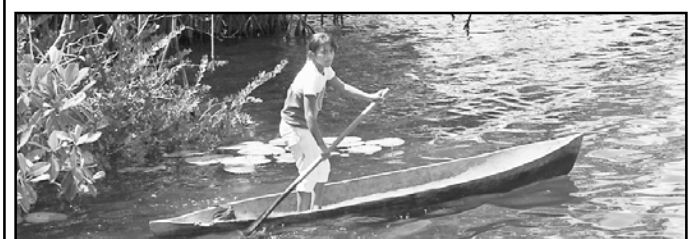
Girl stands in her cayucos as she leaves the "big" school at noon.