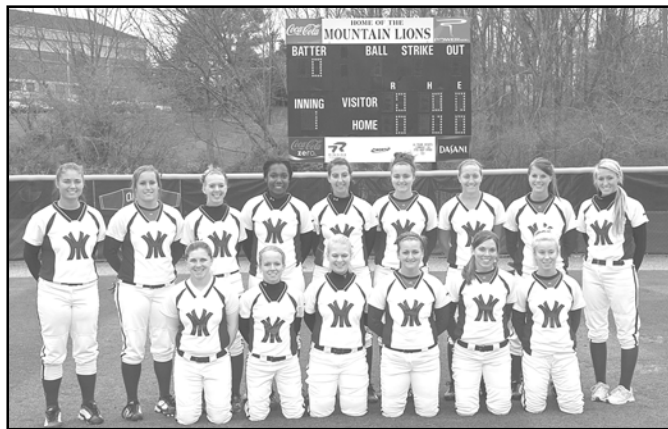
2009 Young Harris College Softball Team