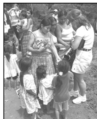
Giving out bags of yarn and knitting supplies to parents at the "little" school.