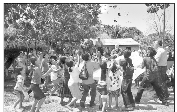
Using the parachute to toss candy into the air at the "big" school.