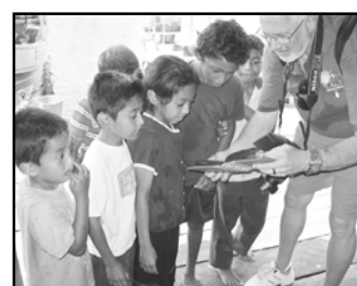
Showing wide-eyed children their photos taken from the 2008 trip.