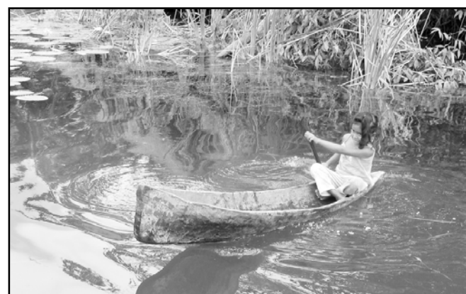
Little girl paddles her cayucos around in the lake as she fishes for supper.