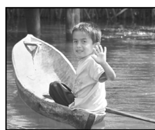
My little buddy from last year meets us in his cayucos at the river store.