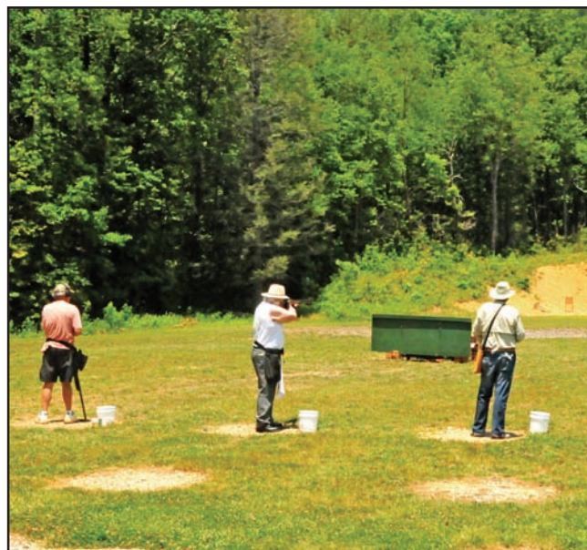
Shooters braved hot temperatures to raise money for the Georgia Sheriff's Association Youth Homes.