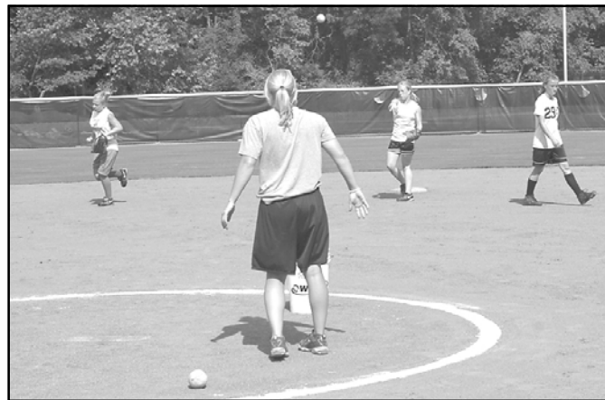
Outfielders practice their fielding fundamentals at sixth annual YHC softball camp.