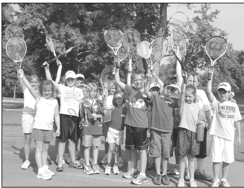
Tennis players from the 2008 camp vastly outnumbered the 2009 enrollees.