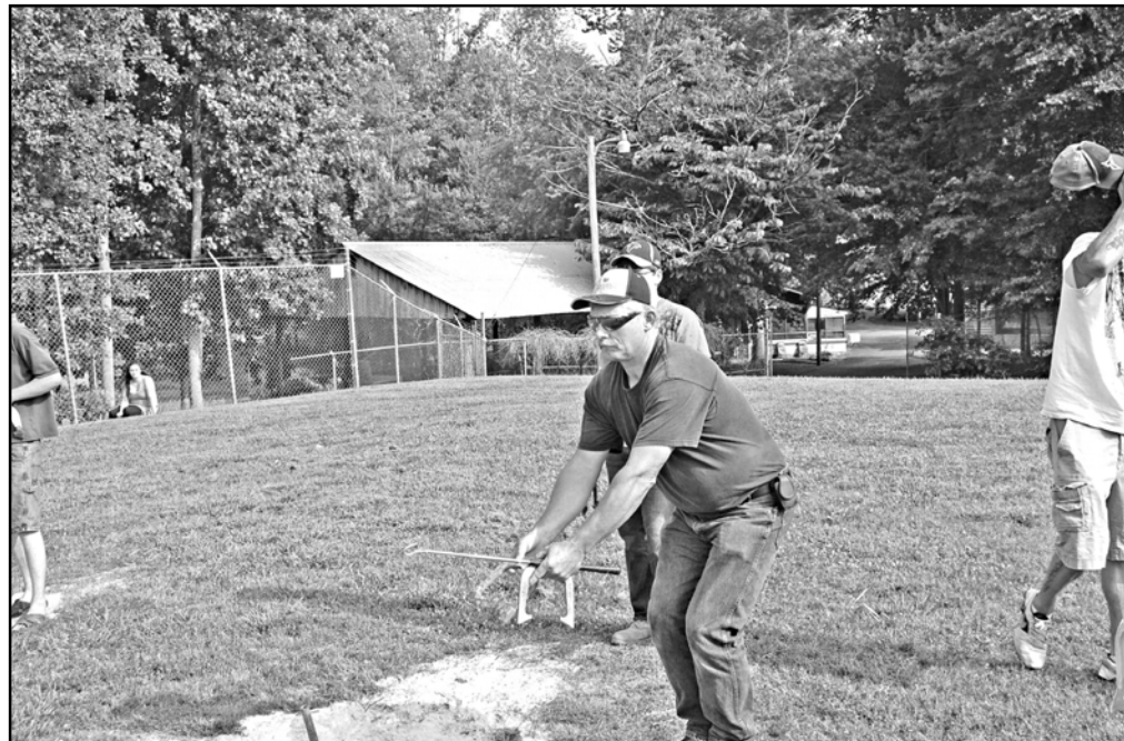
A horseshoe tournament on Recreation Day in Towns County.