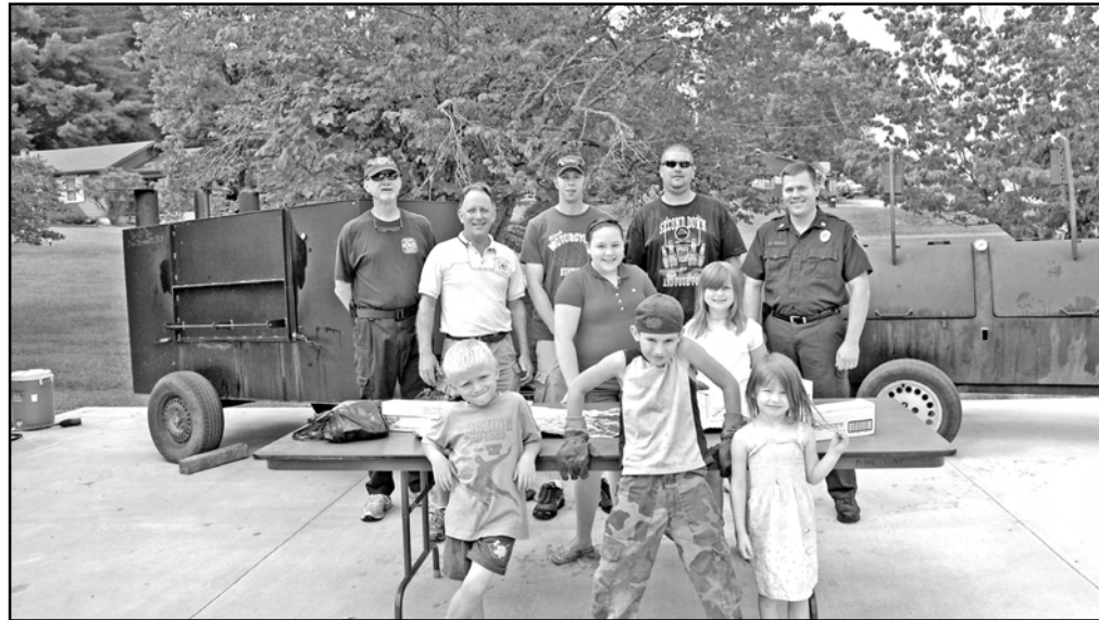
Nothing wrong with a little Firehouse Barbecue. The Young Harris Volunteer Fire Department worked long and hard on Saturday selling Boston Butt roasts slow cooked on a barbecue. They also had BBQ sandwiches and BBQ plates available for hungry and interested customers.