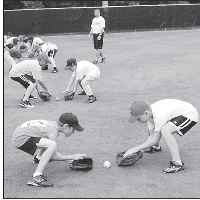
Youngsters learn the fielding drill during baseball camp at Young Harris College.

Wow, school must be just around the corner.