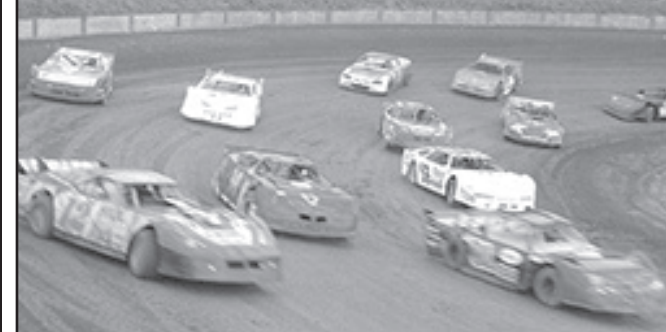
The Modified Street cars are action packed every Saturday night at Tri-County.