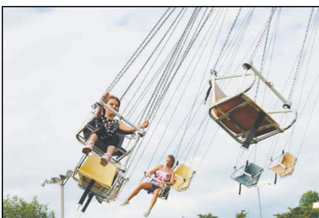
From parade floats to carnival rides, the Georgia Mountain Fair was a major attraction for tourists last week in Hiwassee.