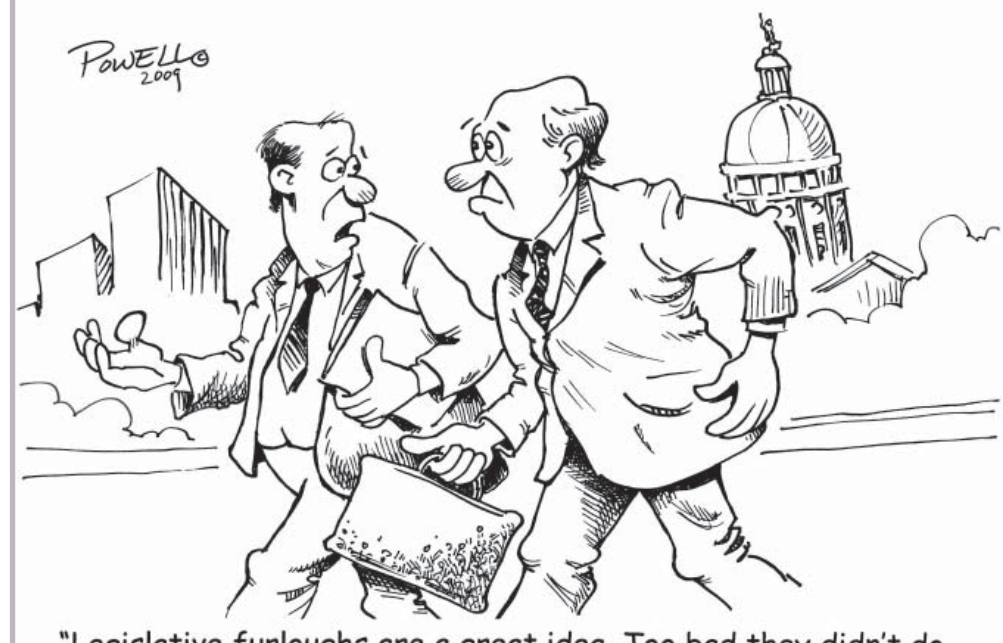
"Legislative furloughs are a great idea. Too bad they didn't do that when the General Assembly was in session!"

Bottom line, the Georgia Mountain Fair is our annual showcase of our com-