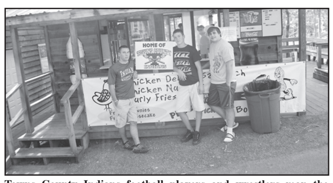
Towns County Indians football players and wrestlers man the Chicken Sandwich Booth