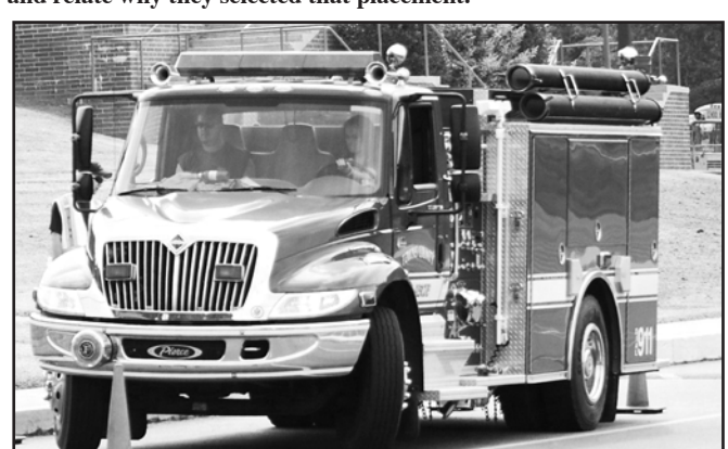
In a difficult maneuver Dianne Nelson parallel parks the large fire-truck within 6 inches of the curb.