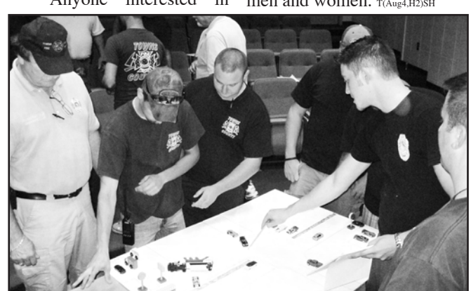
Firefighters work on a tabletop problem dealing with where to place emergency vehicles arriving on an accident scene. Divided into several groups each had to place the responding vehicles at the "scene" and relate why they selected that placement.

public service is urged to contact the Fire and Rescue unit who like the Marines are always looking for a few good men and women. T(Aug4-H2)SH