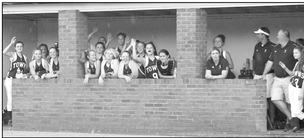
The Indians got a break as the floods came and the game was temporarily called.

It was pouring down rain at the house, bright and sunny at the YHC softball field and looked like a good day for a softball scrimmage against the UC Lady Panthers. Wrong! Half way into the second inning, the skies opened and the bottom fell out, forcing a cancellation of the field soaked game. The score after one inning was 3-0 in favor of the felines. The field was too muddy for a reschedule so the game was called.