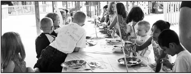
Party at the Towns County Beach Park

It has been a wonderful summer at the library as 263 children enjoyed stories and crafts related to the "Make a Splash.. READ!" theme. With the warm temperatures outside, the water theme was a welcome one. The children received prizes each week by "picking up ducks" from a pool of water. We also had 44 children to sign up for the Vacation Reading Program. These children kept track of the books they read all summer and received a certificate for their reading efforts. Thank you to our 2010 sponsors: Xaxby's, United Community Bank, Bank of Hiwassee, State Farm Insurance, Noblet's 5 & 10, Stephens Federal Bank, and Papa's Pizza. A Fall & Winter storytime will be offered at Towns County