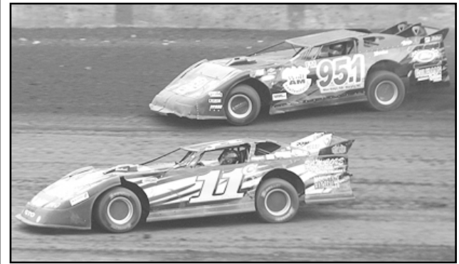
The Southeastern Sportsman Series will bring around 20 cars to Tri-County this Saturday night.