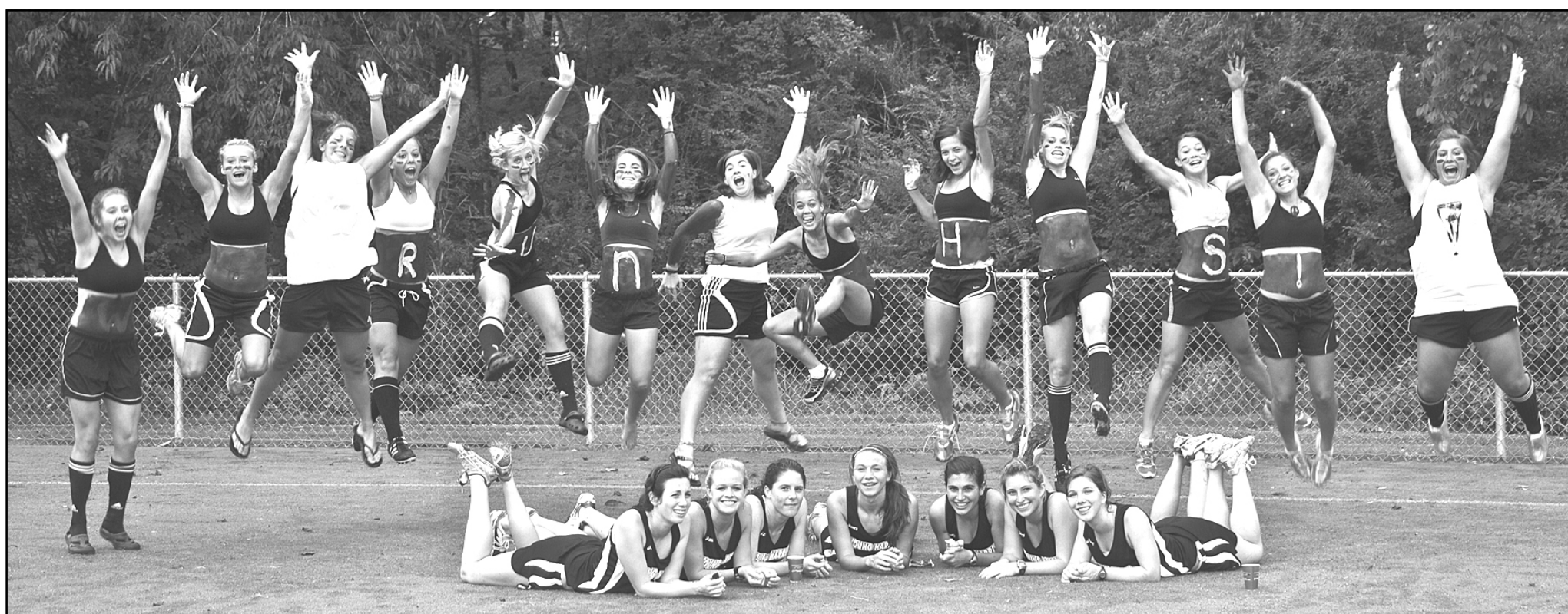
The YHC women's soccer team celebrates the CC win by the Lady Mountain Lions.