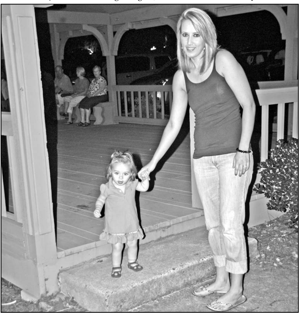
These ladies love fireworks and they got their fill on Labor Day weekend.

The H.O.G. Rally, Sept. 8-10, is a first in Towns County.