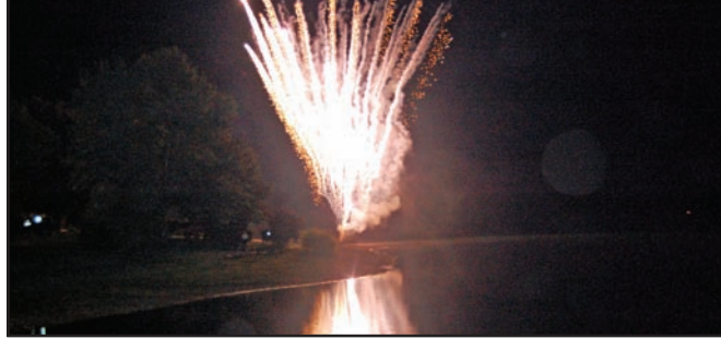
The 2011 Rally was a huge success.