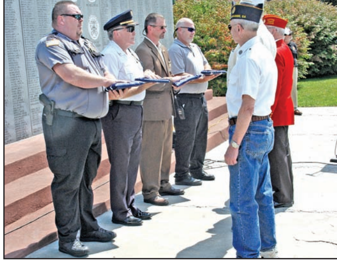
Public Safety officials receive American flags during Sunday's 9/11 Remembrance Ceremonies at Veterans Park.