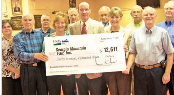
Everyone was smiling on Wednesday.