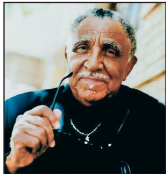
Dr. Joseph Lowery