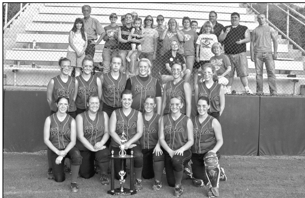
Fannin County Lady Rebels Runner-Up 2009.