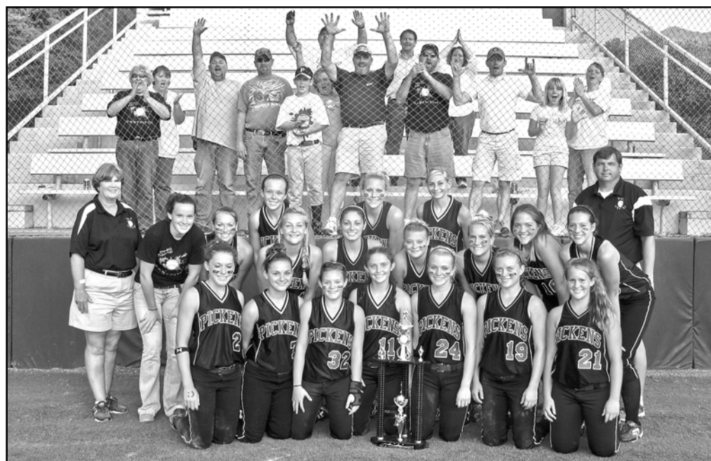
Pickens County Lady Dragons, Champions 2009