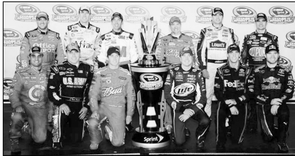
2009 Chase Drivers: Back row: L-R: Tony Stewart, Carl Edwards, Greg Biffle, Mark Martin, Jimmie Johnson, Jeff Gordon. Kneeling: Juan Montoya, Ryan Newman, Kasey Kahne, Kurt Busch, Denny Hamlin, Brian Vickers