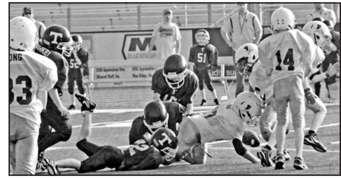
The Termites bring down a Fannin County runner on Saturday.

The Rebels were able to manage a scoring drive with 6:20 left in the game closing the scoring at 19-6. With the game in hand, and time ticking the Indians possessed the ball inside the ten yard line with under a minute to go in the