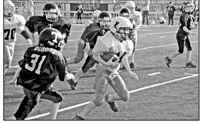
It was a familiar scene on Saturday as the Termites chased the Rebels all day.

game. After a hard fought game by the young Rebel team, the 5-6 year old age group went to Rebel coaching staff decided to stack the middle and charge the over the Dawson County Ti-Indians Quarterback after the gers with a 19-6 victory Satur-Towns coaches opted to take a day. The Indian 7-year old age knee and run out the clock. An group dropped a tough one at Indian player was hurt on the Union County 27-13. play in a decided contest.