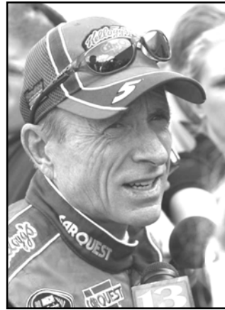
Mark Martin wins at New Hampshire

You may contact the Racing Reporter at: hodgesnews@earthlink.net