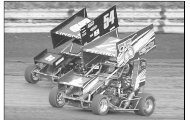
The Georgia Mini Sprints will turn speeds near 100 mph at Tri-County this Saturday.