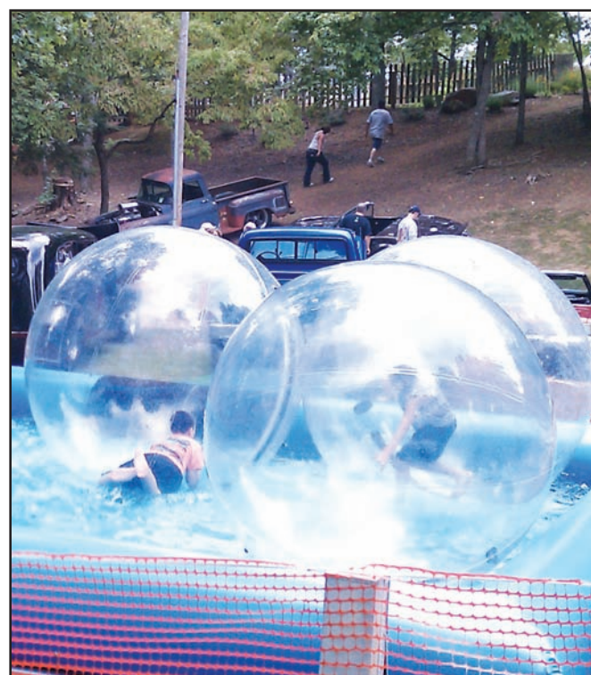
Kids will be walking on water at the Fall Festival Oct. 7-15. New events include live statues, stilt walkers and alligators.