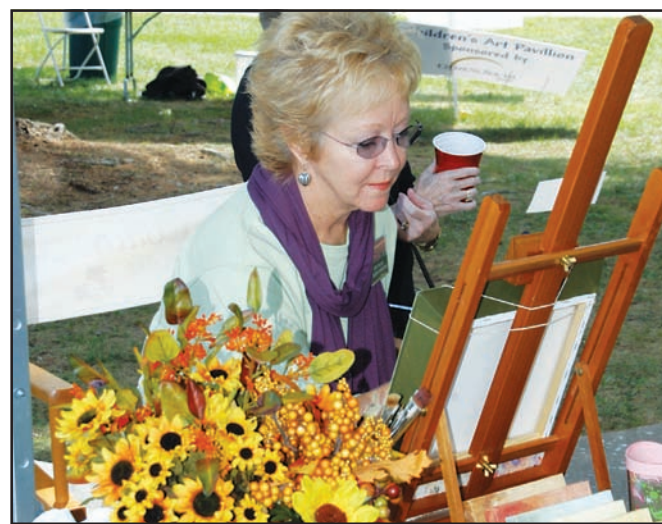
The two-day Summer's Last Kiss: An Affair with the Arts was a winner for artists and event goers.