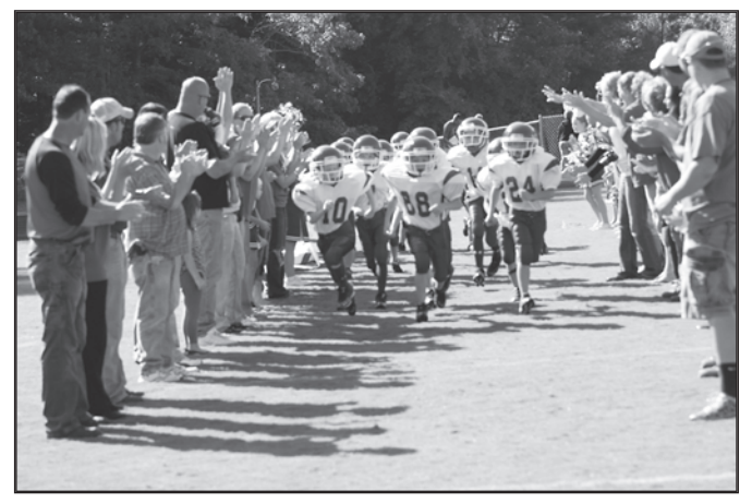
The Tiny Mites continued their winning ways at Frank McClure Stadium