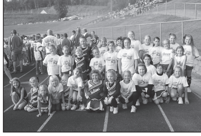
The secret to the Tiny Mites' success could be top notch cheerlead- ers