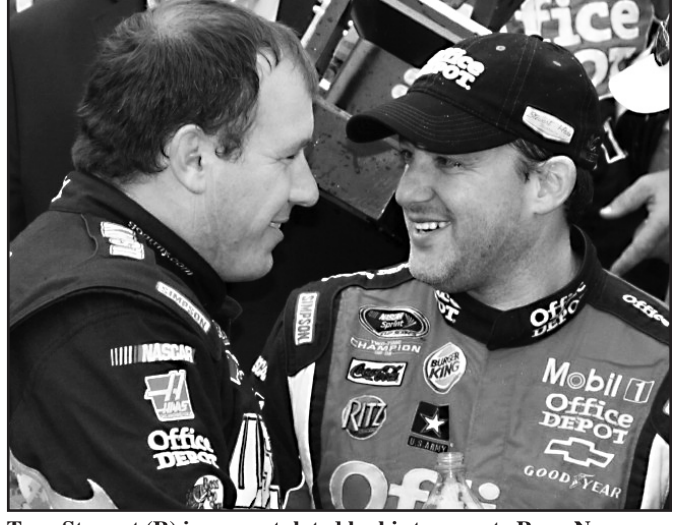
Tony Stewart (R) is congratulated by his teammate Ryan Newman.

"We needed to make sure that it went. It wasn't like there was any gray area that NASCAR was saying maybe we were or weren't legal. We weren't right yet." There is not expected to be any penalties from NA-