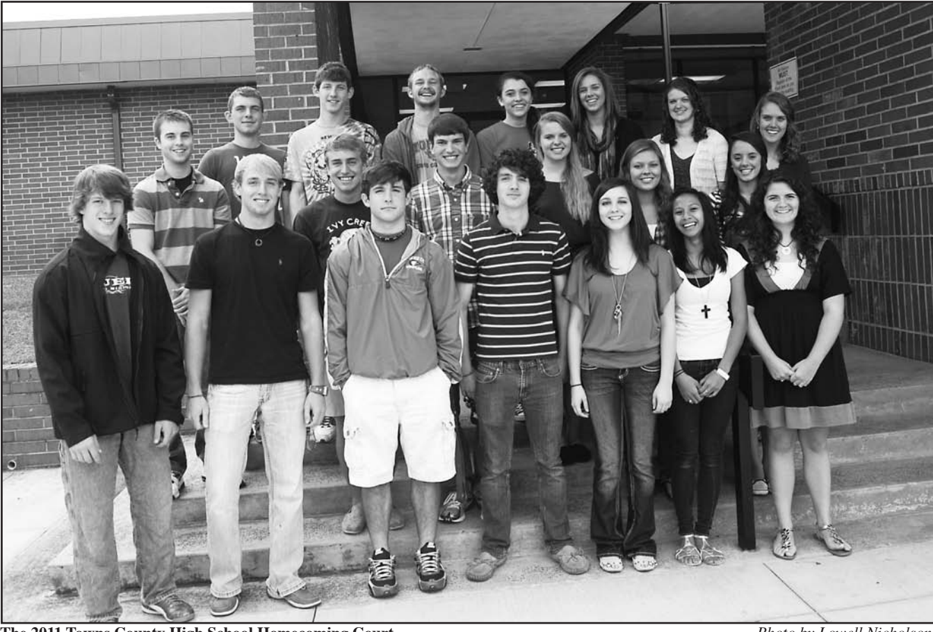
The 2011 Towns County High School Homecoming Court